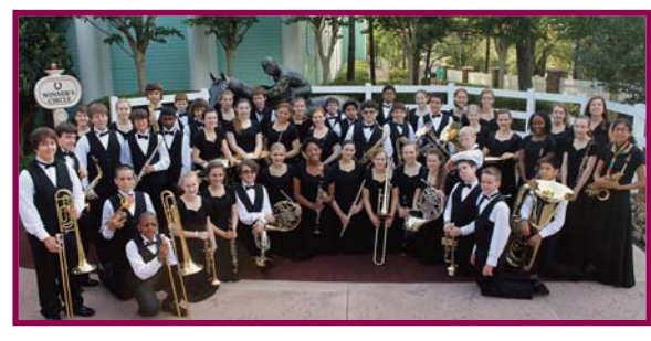
District Vision: 100% Student Success

District Mission: Educate and prepare each student for college, career and life